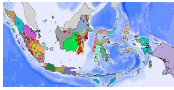
Figure 1: The Map of Location Coal reservation (geological divisions of Energy and Mining Ministry, November 2015)

Based on the data from coal and mining ministry (ESDM), the amount of coal resources in Indonesia currently is about 26.2 Billion ton, and its productions is about 461 million ton. Therefore, it can be estimated that now, the coal resources are still 56 years more except we found another new coal resources or new product management. <sup>11</sup> If it is compared to German and China, they do not use their coal as primary sources of fuel,